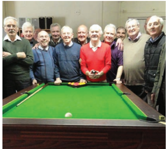
Participants in Dublin Men's League, Care Local, Dublin