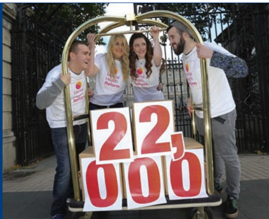
Pictured below: The launch of this year's campaign for mental health funding in the Budget 2015 and the handover of 22,000 signatures on a petition to Minister Kathleen Lynch .

The Community Foundation for Ireland works with companies in a variety of ways through managing and administering donor advised funds as well as bespoke community grant schemes on behalf of corporate donors. This can include managing payroll giving on behalf of companies providing the company with support guidance and administrative support. CFI has managed Fedex Ireland's payroll giving scheme for a number of years and in that time employees have donated in excess of €25,000 to worthy causes across the country including The Children's Medical Research Foundation.