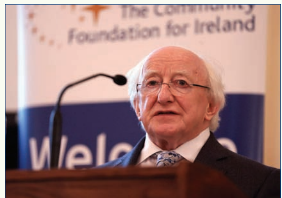
Our Patron President Michael.D.Higgins addresses the audience at our 100 year celebrations in May 2014

today, I am sure he would be astonished to learn that there are now almost 1800 community foundations in more than 50 countries across the world, managing in excess of €40 billion in assets. All share the same basic attributes of community foundations everywhere, namely prudent financial stewardship of endowed assets; knowledgeable and effective grant making to local charities using the income from those assets; and a capability and desire to improve the lives of thousands of people by connecting donors who care with causes that matter.”