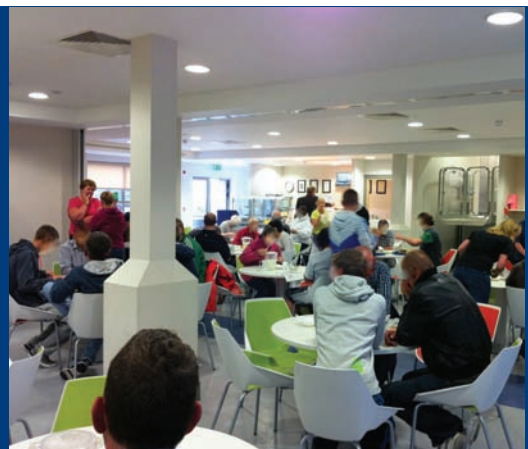
Merchants Quay Ireland, Riverbank Centre