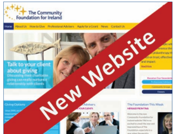
New website launched www.communityfoundation.ie

MHR provides a forum for organisations working within the field of mental health and related fields to come together to represent the issues and concerns of hundreds of thousands of people in Ireland coping with a mental health problem and are the only mental health organisation in Ireland representing such a broad spectrum of organisations.