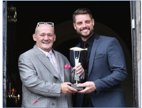
Brendan O'Carroll, Winner of the 2014 Philanthropist of the Year Award with 2013 Winner Keith Duffy